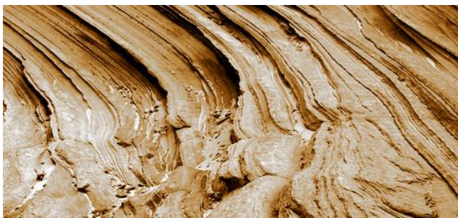
NEAR AND SUBSURFACE STUDIES

CVA Group benefits from more than 30 years experience Worldwide - from upstream to downstream