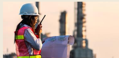
PRODUCTION - SURFACE