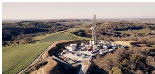
GEO-RESOURCES EXPLORATION & MANAGEMENT