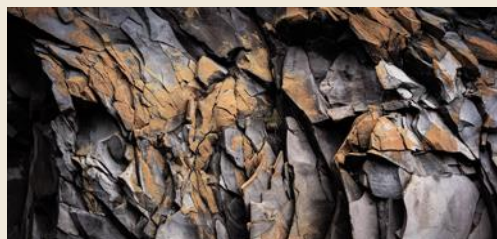
GEOSCIENCES & RESERVOIR

CVA's reputation is based on the professionalism of more than 300 employees and on the quality of the solutions we've developed